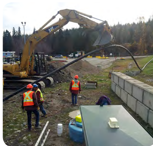
Leachate Connector construction

Upon Board approval, the leachate connector infrastructure to tie into the City of Prince George waste water collection system was installed during the 2015 construction season. The total cost for this project was $450,000. Pending on approval of the discharge permit from the City of Prince George, the leachate recirculation system at the facility will be decommissioned after 14 years of service.